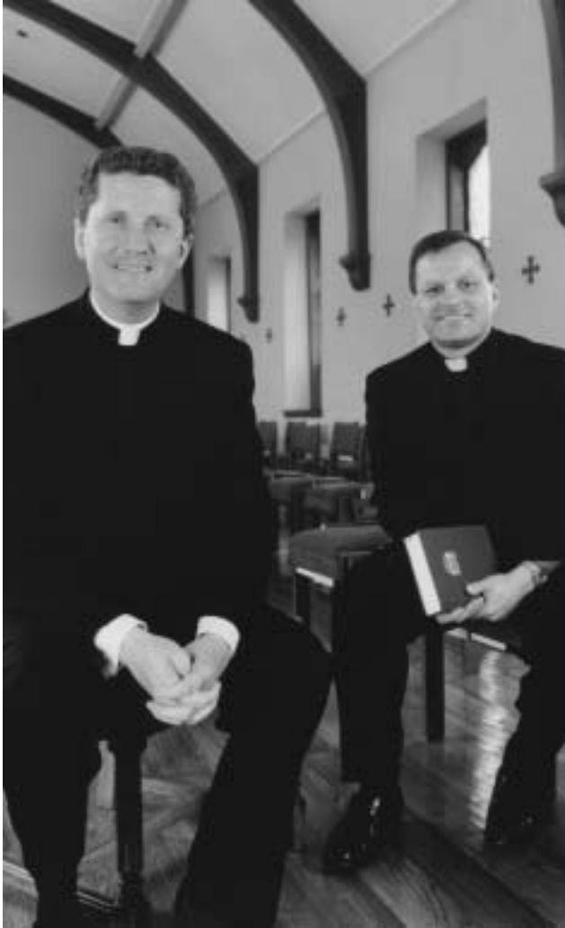
Lewis Hall and Alfieri Hall (973) 761-9575 theology.shu.edu