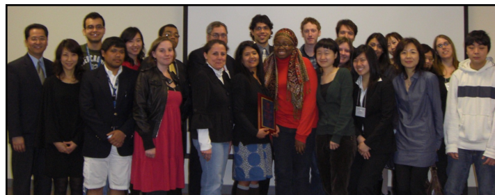
Participants and attendees of the Fourteenth Annual Graduate Student/School Teacher Symposium on Japanese Studies held in the Beck Room of the Walsh Library.